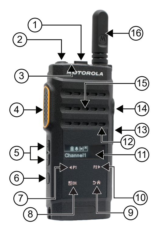
Table 4: Callout Legend