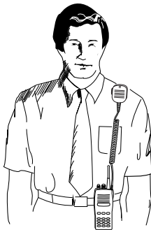
Figure 1. Wearing Your Accessory

For optimum performance from your RSM, wear the radio and RSM so that the accessory cord does not cross over or touch the antenna. Also, try to wear the radio and accessory combination fairly close to each other to avoid strain on the accessory connector.